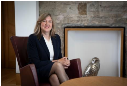
Rt. Hon Alison Johnstone MSP Presiding Officer

Rinn sinn an ro-innleachd àrd-mhiannach seo le co-obraichean thar Seirbheis Phàrlamaideach na h-Alba, a' cleachdadh an eòlais aca air conaltradh le Buill, luchd-obrach is am poball. Tha e a' mineachadh mar a dh'obraicheas sinn san t-Seisean gus ar dealas a choileanadh gus piseach a thoirt air beatha muinntir na h-Alba.